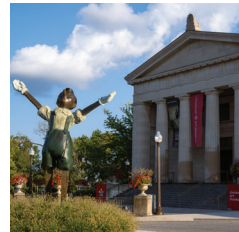
AT THE CINCINNATI ART MUSEUM